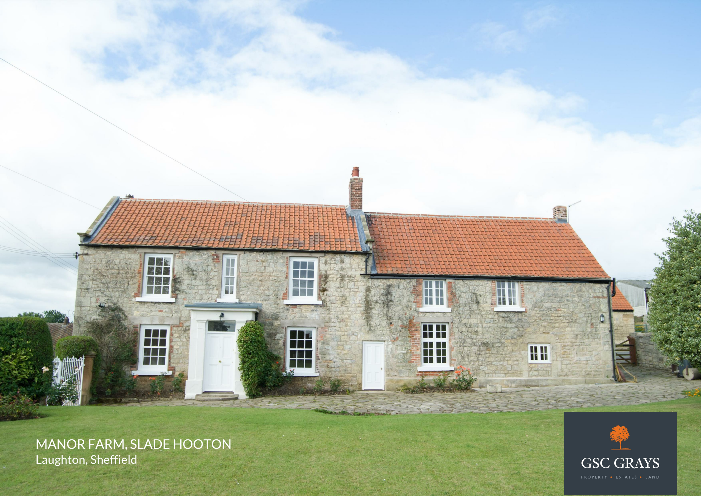
MANOR FARM, SLADE HOOTON Laughton, Sheffield