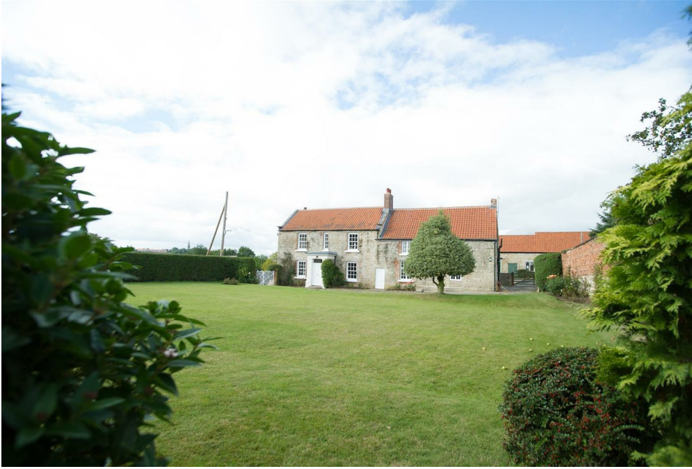
Manor Farm, Slade Hooton