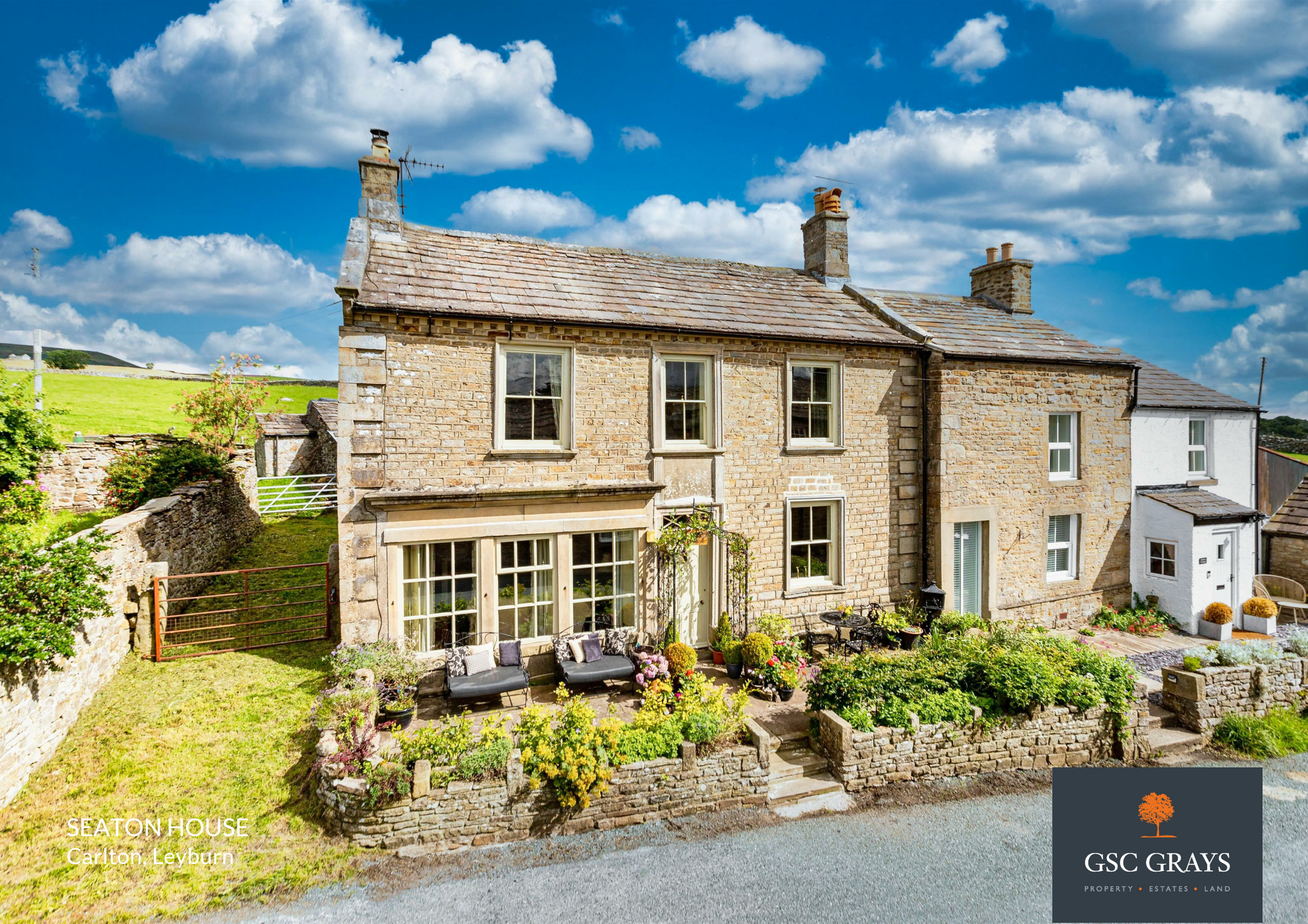
SEATON HOUSE Carlton, Leyburn