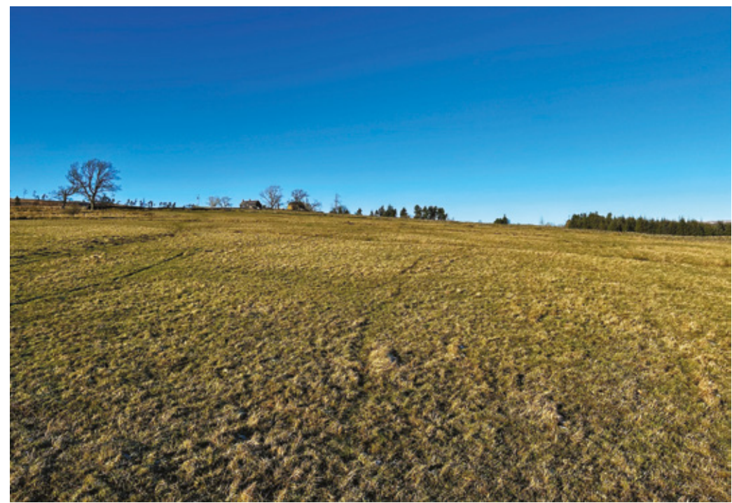
Post Code DL13 2EX