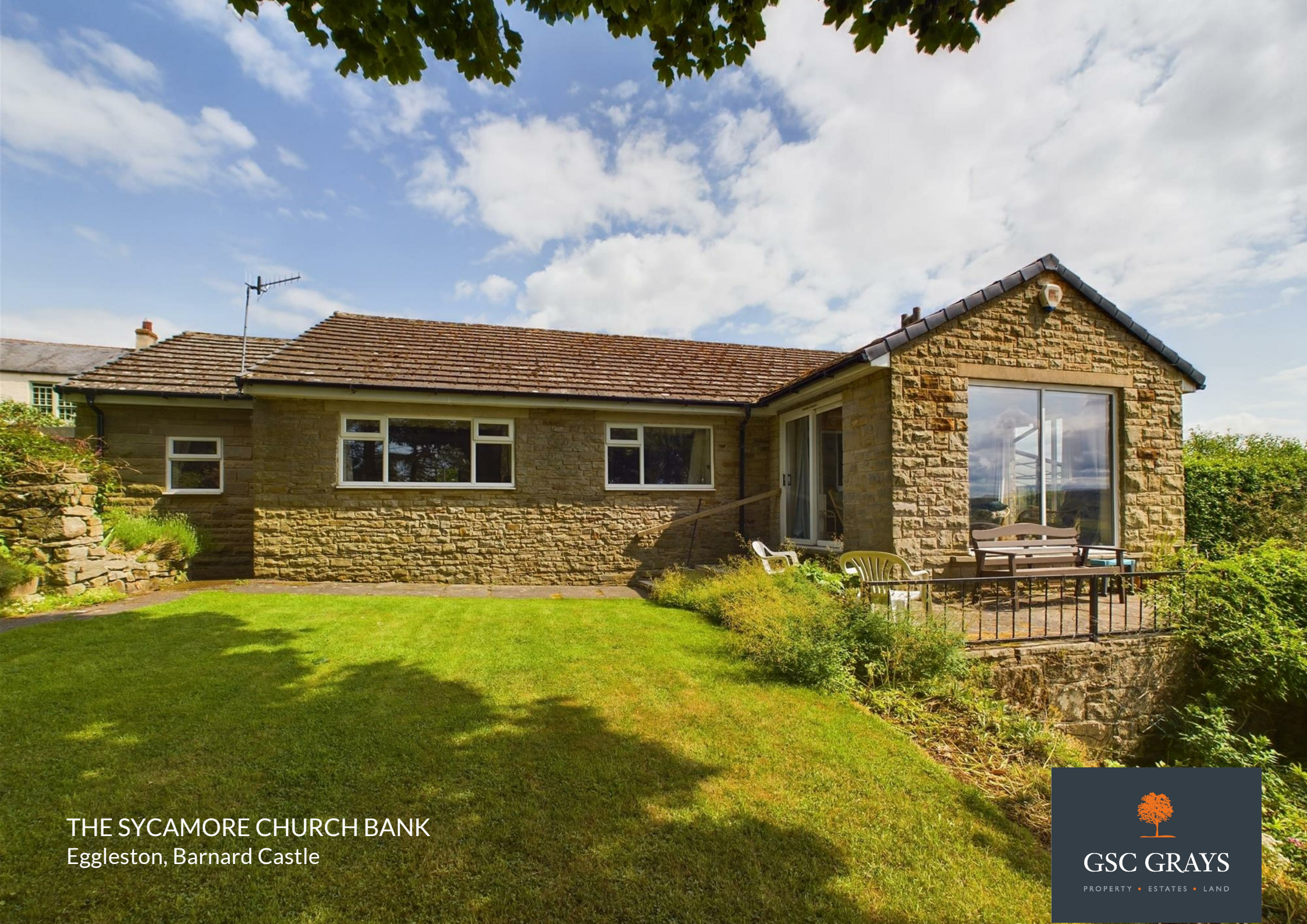
THE SYCAMORE CHURCH BANK Eggleston, Barnard Castle