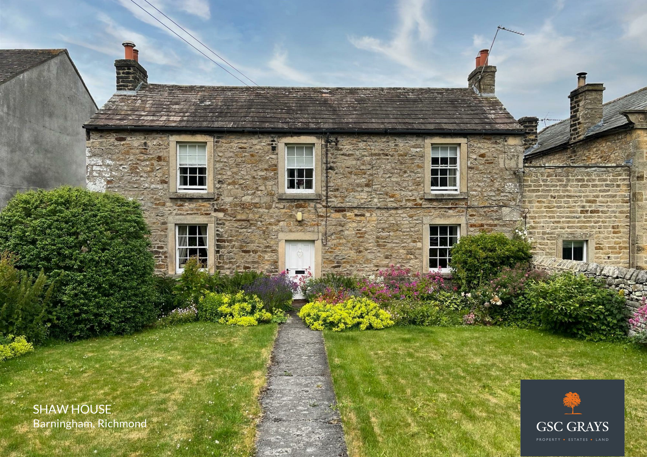
SHAW HOUSE Barningham, Richmond