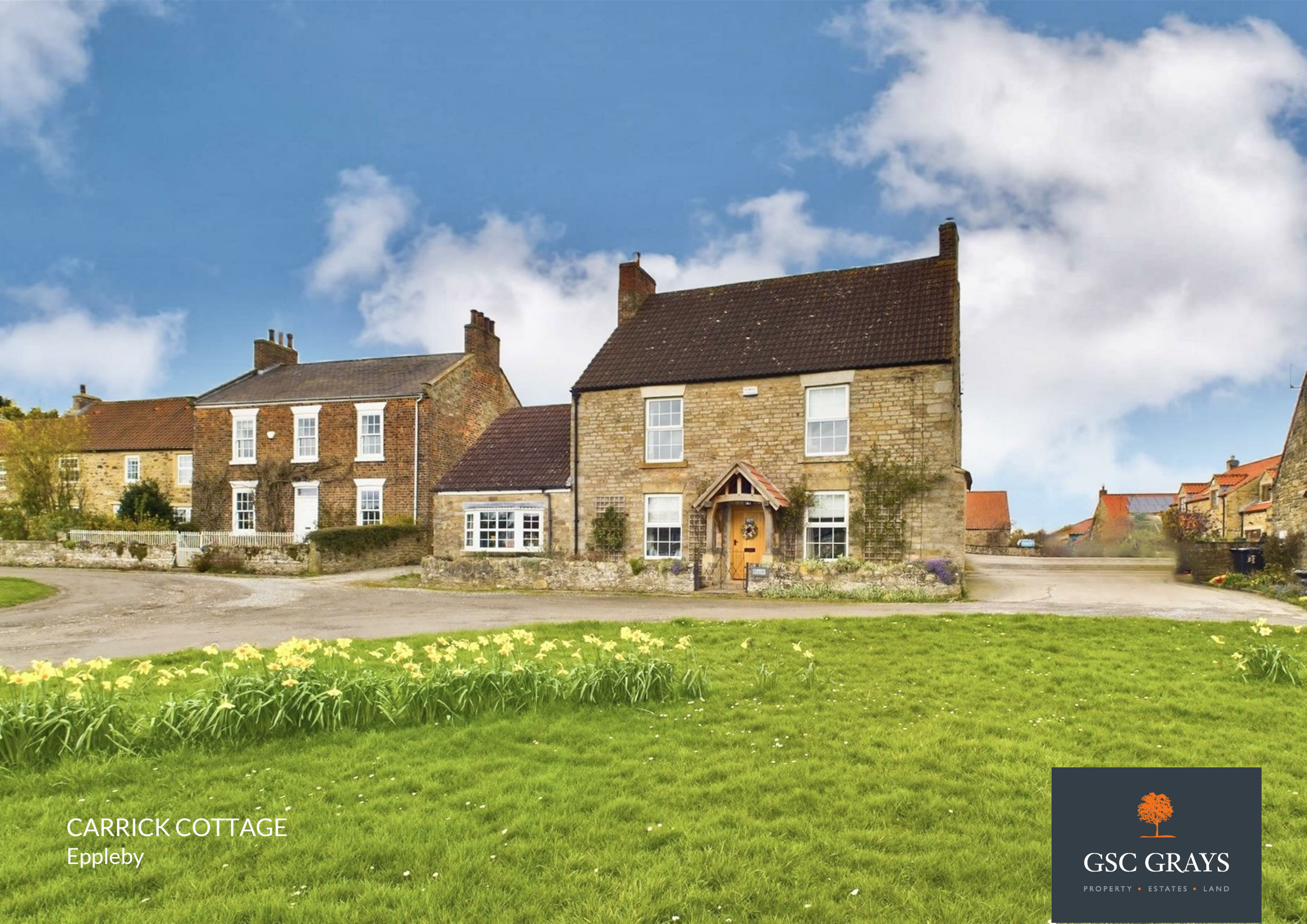
CARRICK COTTAGE Eppleby