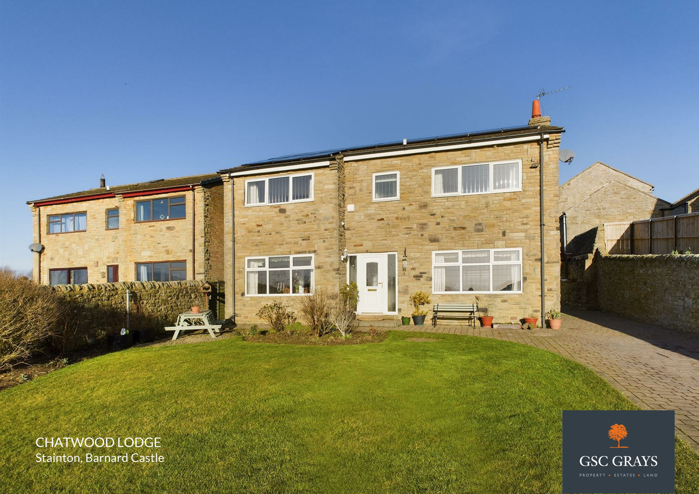
CHATWOOD LODGE Stainton, Barnard Castle