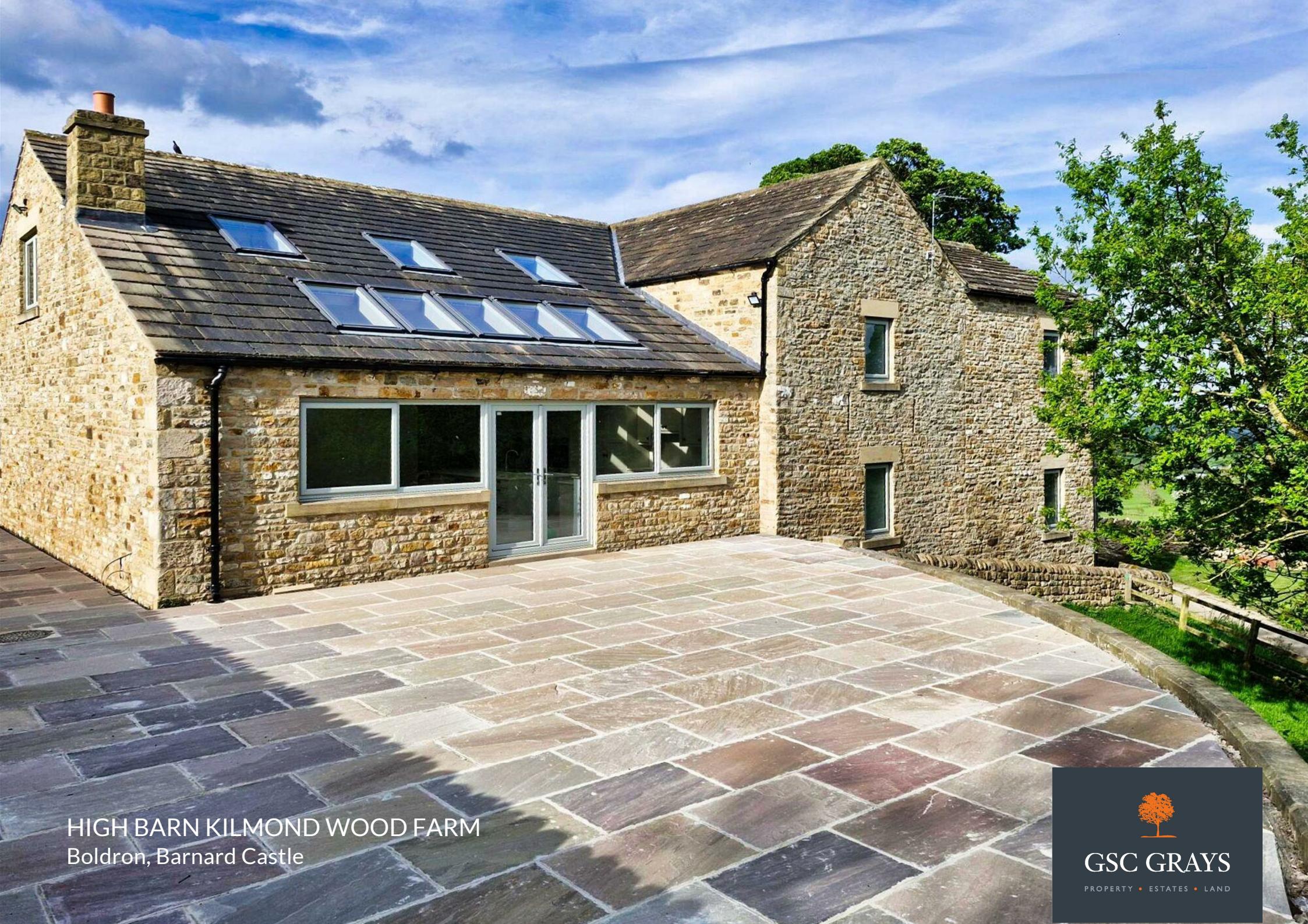
HIGH BARN KILMOND WOOD FARM Boldron, Barnard Castle