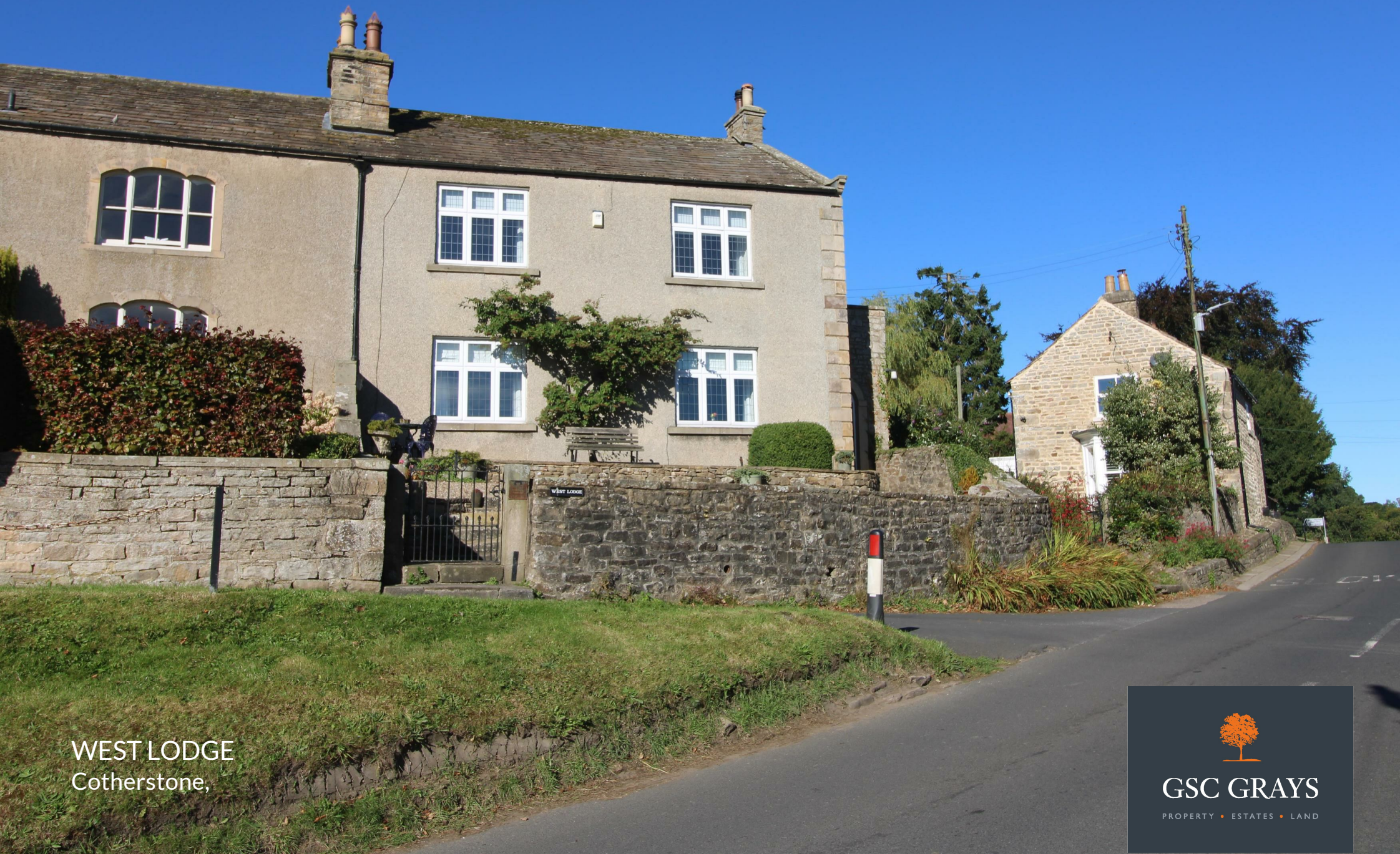
WEST LODGE Cotherstone,