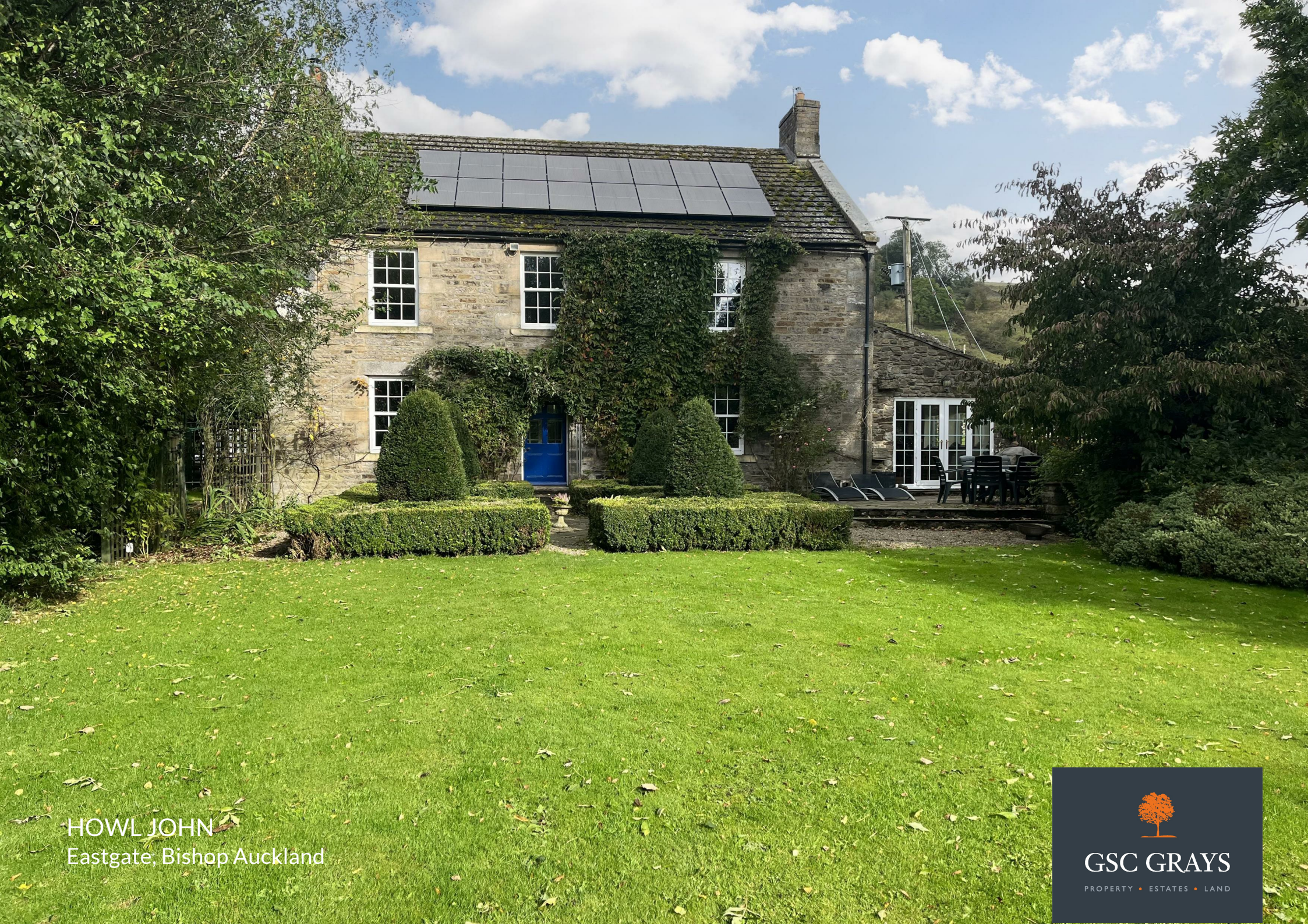
HOWL JOHN Eastgate, Bishop Auckland