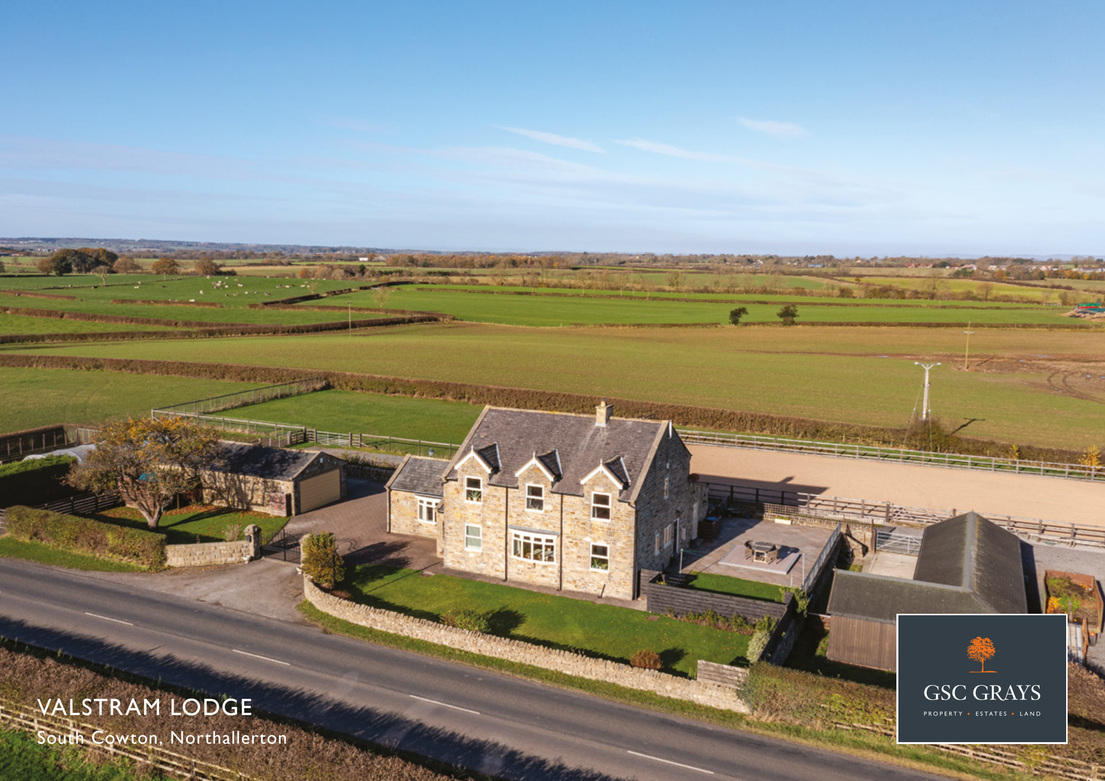
VALSTRAM LODGE South Cowton, Northallerton