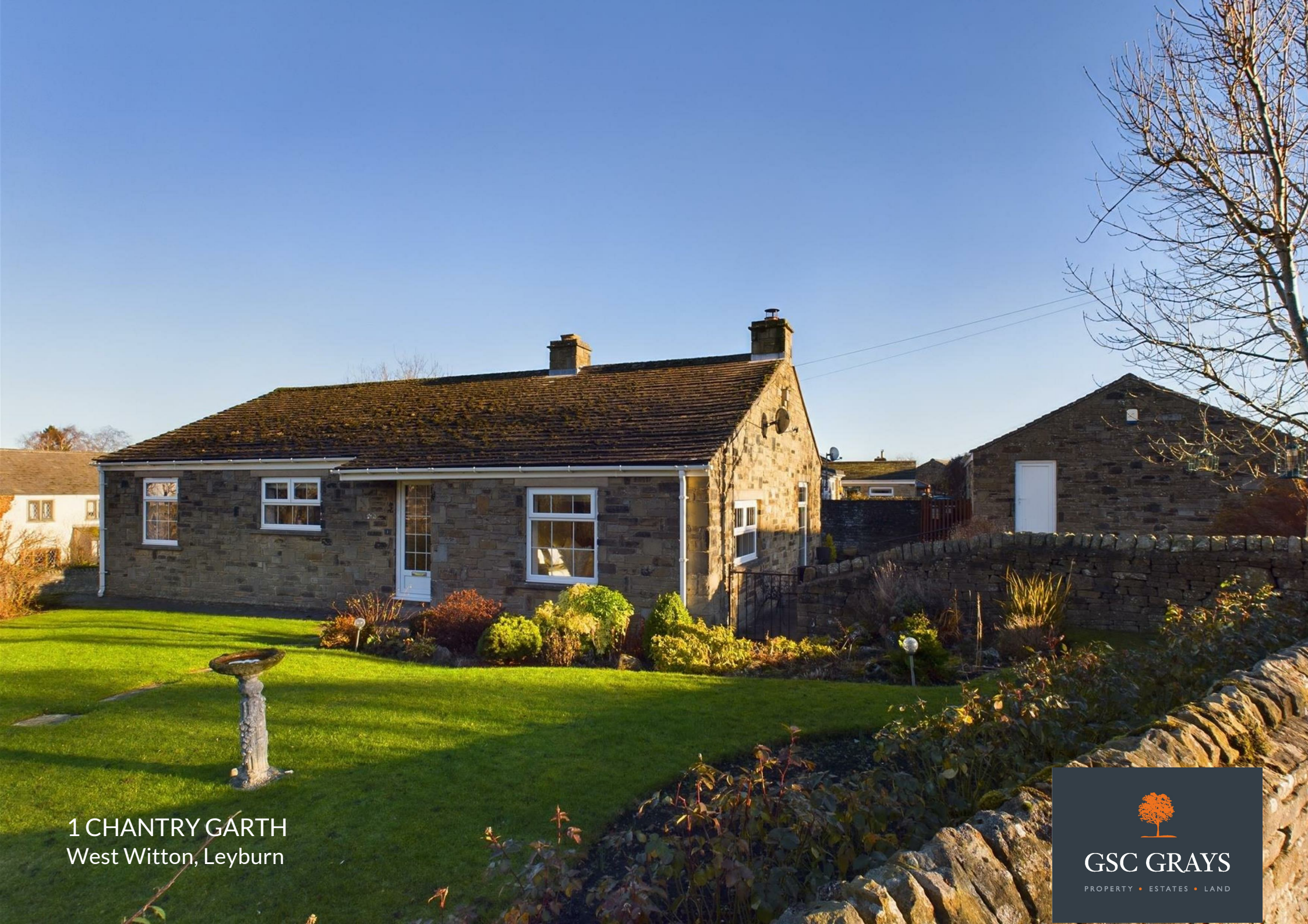
1 CHANTRY GARTH West Witton, Leyburn