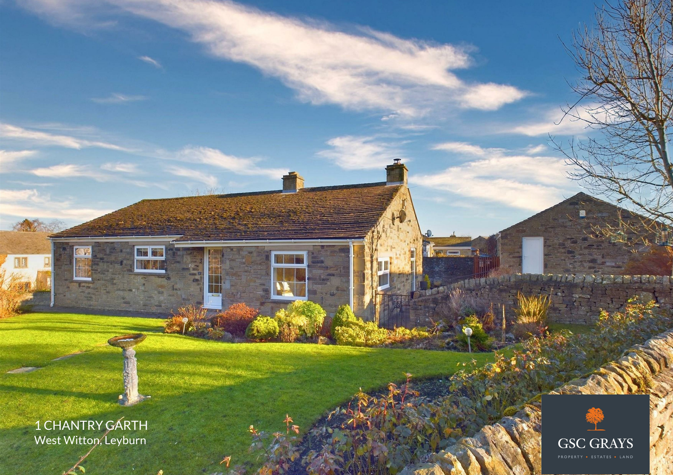
1 CHANTRY GARTH West Witton, Leyburn