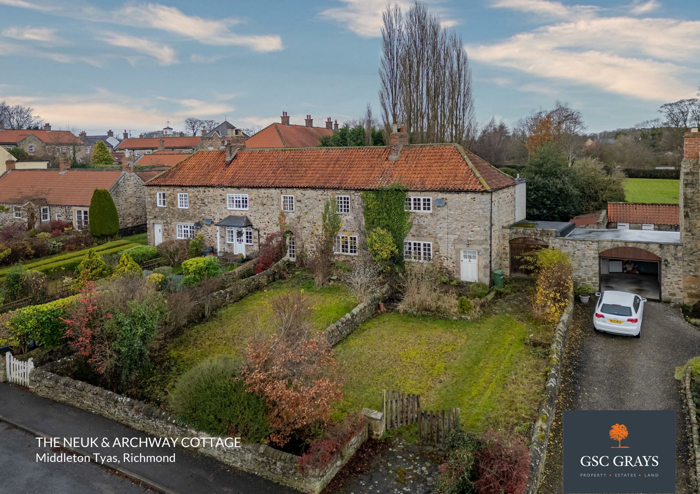
THE NEUK & ARCHWAY COTTAGE Middleton Tyas, Richmond