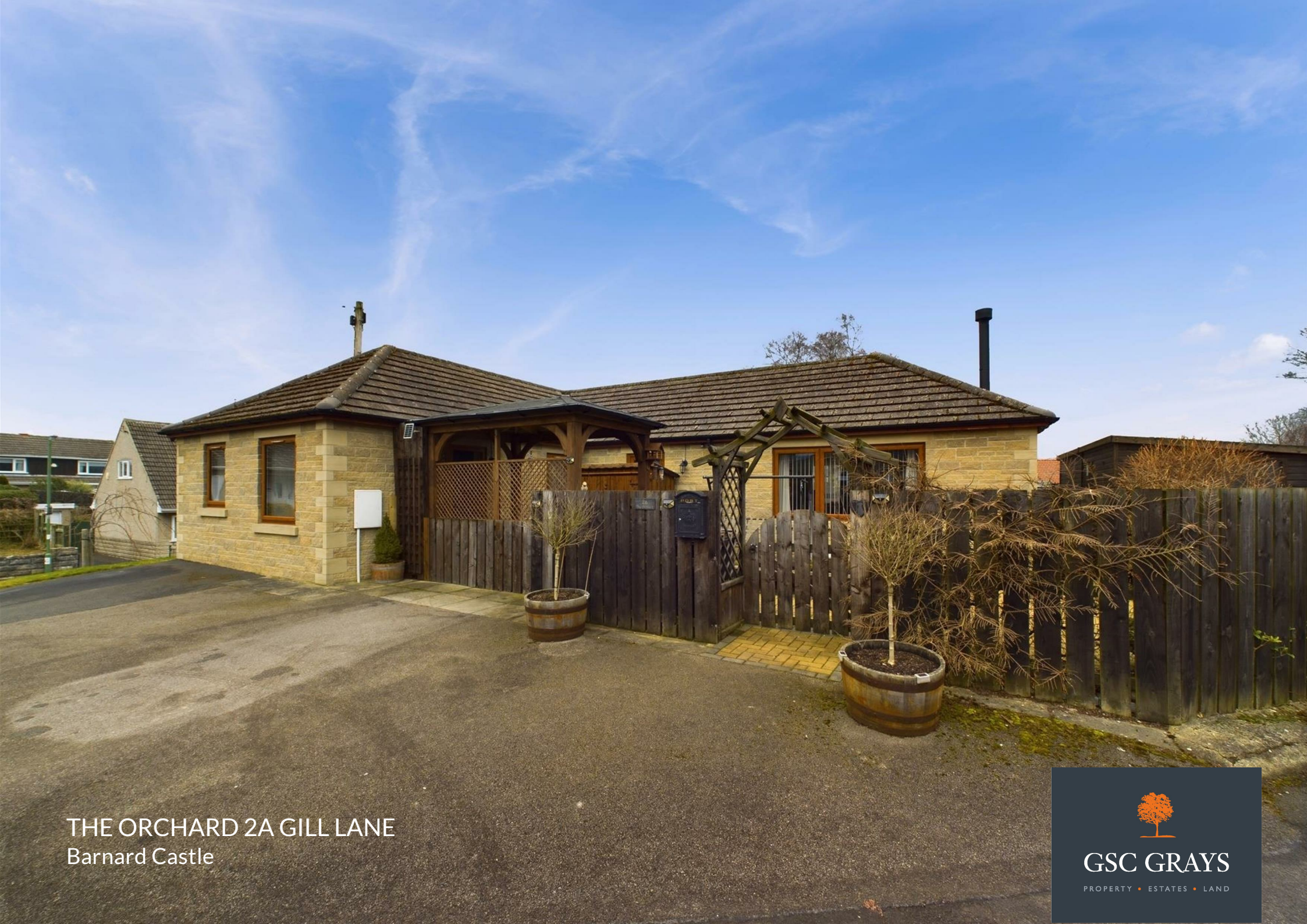
THE ORCHARD 2A GILL LANE Barnard Castle