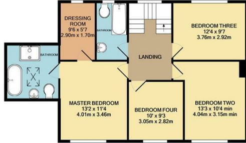
FIRST FLOOR APPROX. FLOOR AREA 755 SQ.FT. (70.0 SQ.M.)