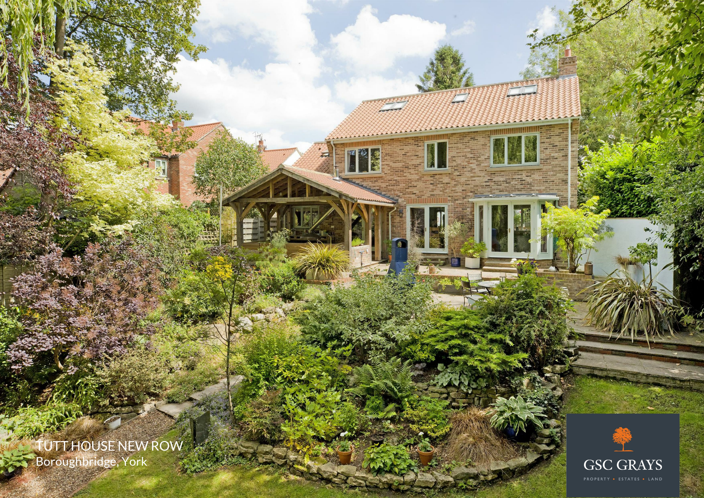
TUTT HOUSE NEW ROW Boroughbridge, York