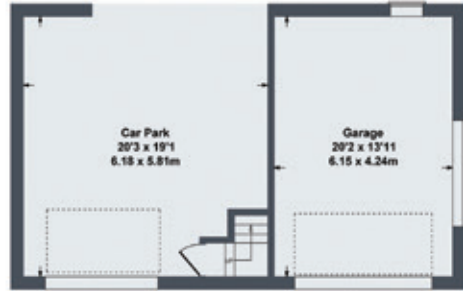
GARAGE GROUND FLOOR