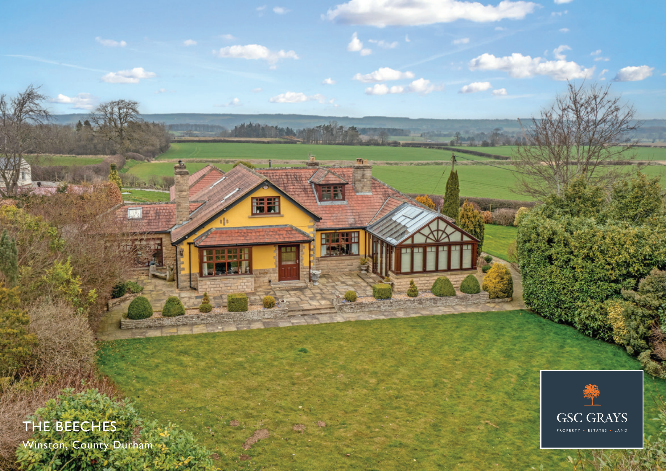
THE BEECHES Winston, County Durham