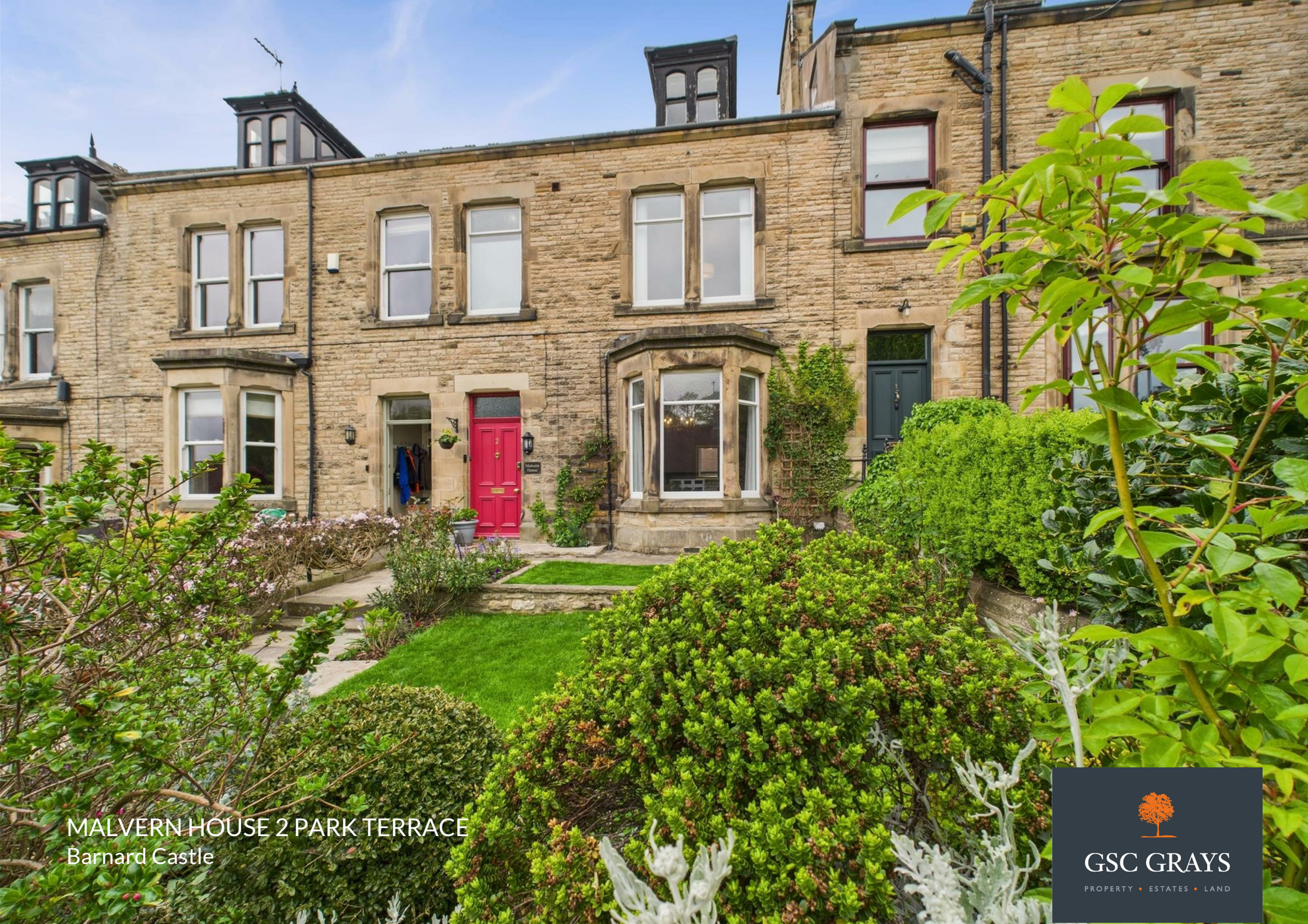
MALVERN HOUSE 2 PARK TERRACE Barnard Castle