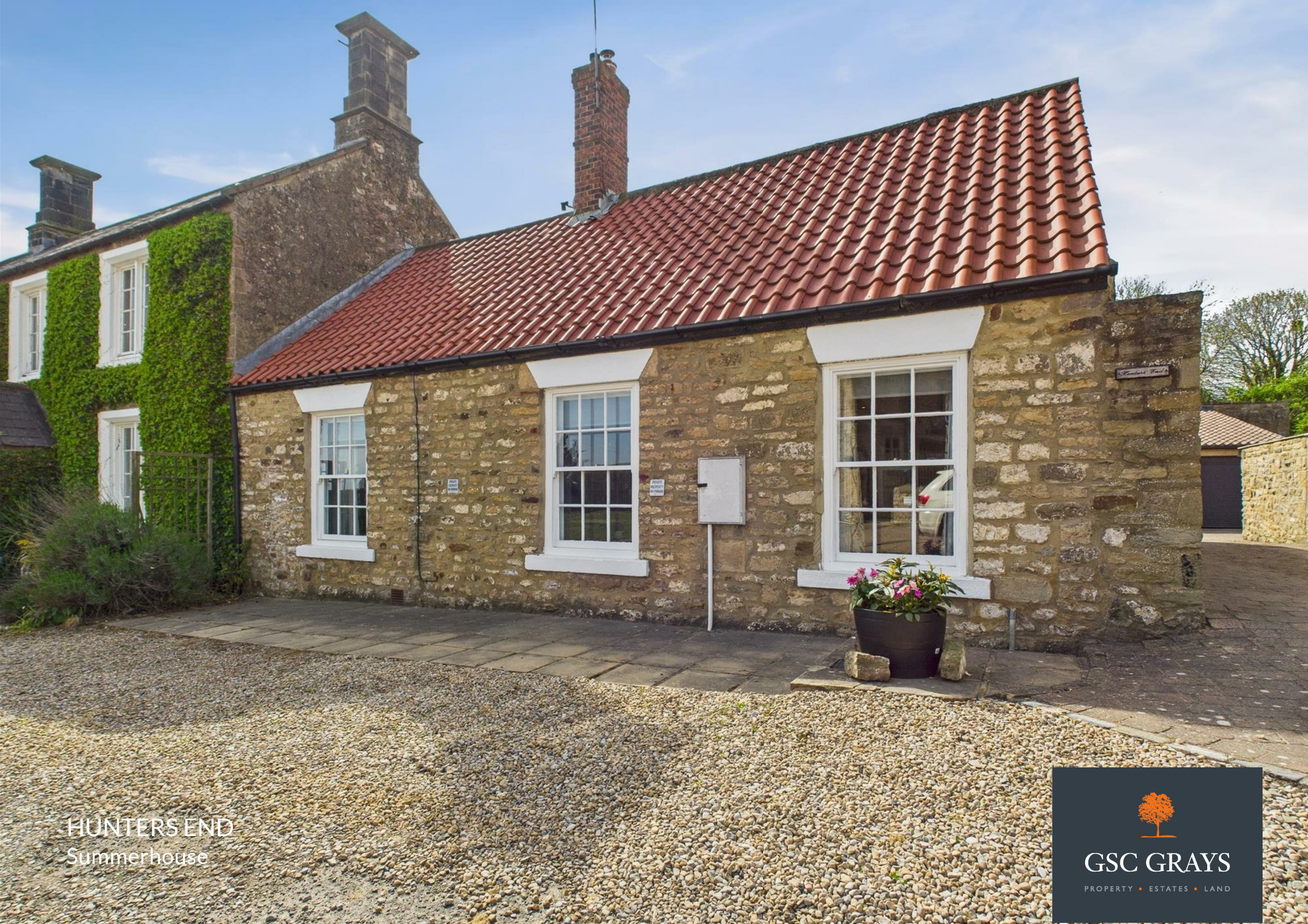
HUNTERS END Summerhouse