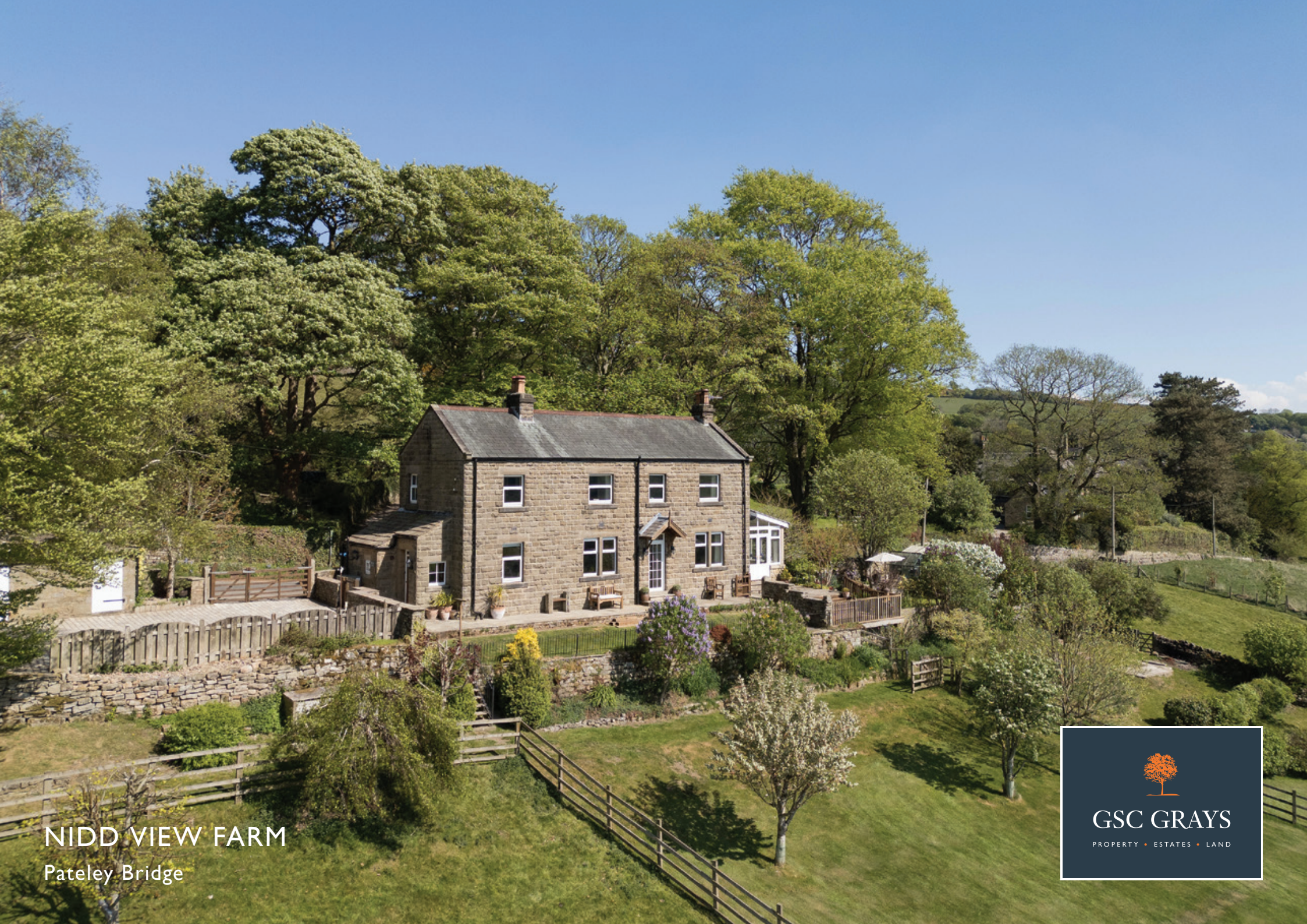
NIDD VIEW FARM Pateley Bridge