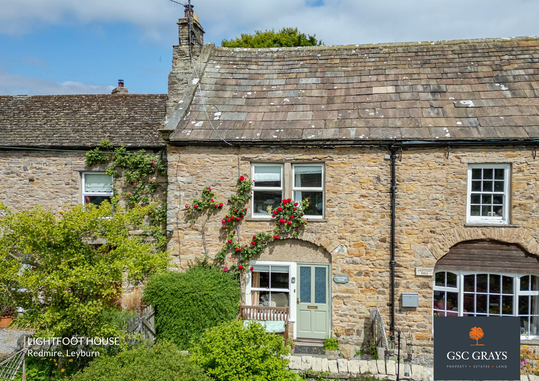
LIGHTFOOT HOUSE Redmire, Leyburn