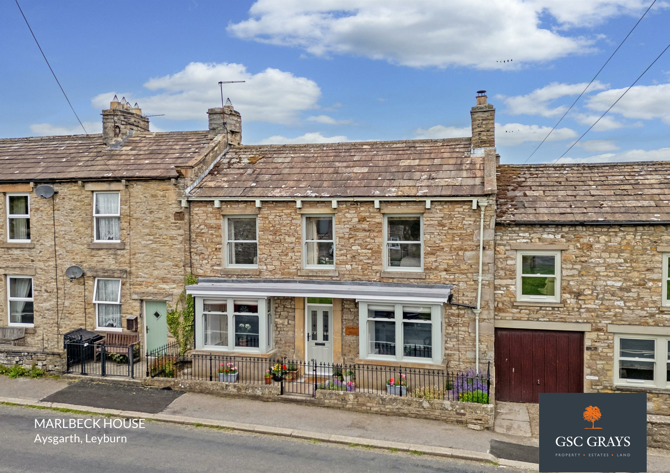
MARLBECK HOUSE Aysgarth, Leyburn