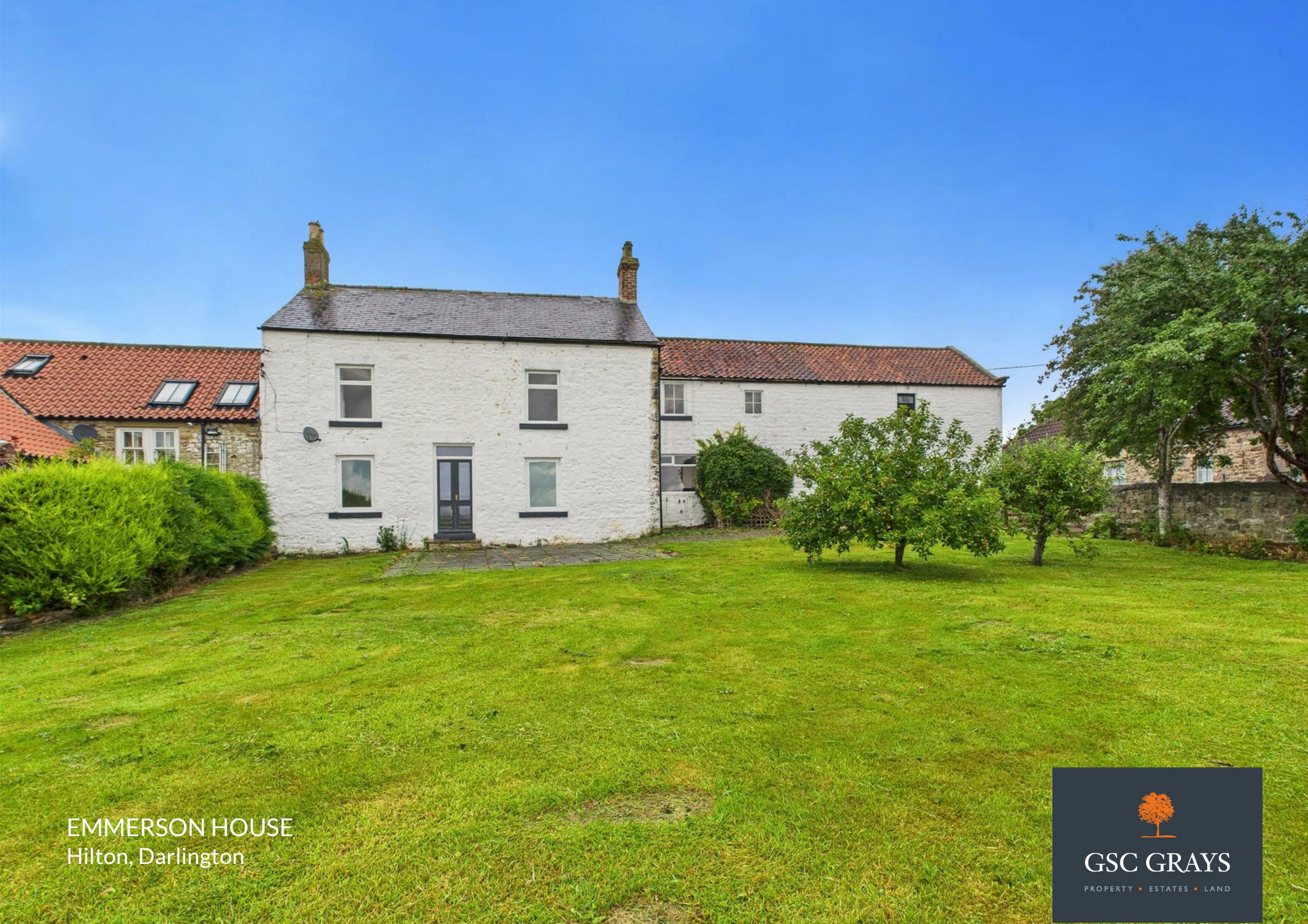
EMMERSON HOUSE Hilton, Darlington