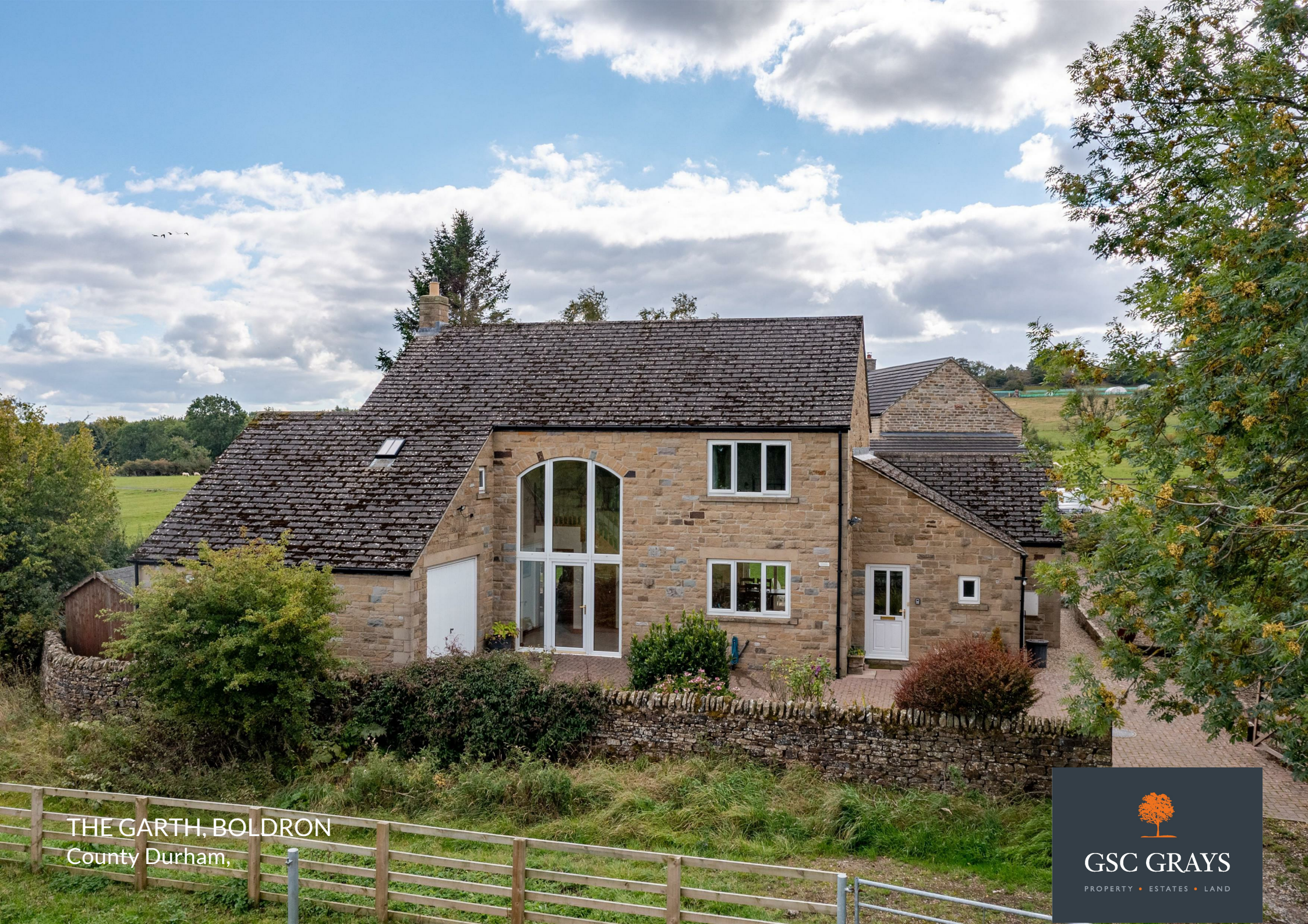
THE GARTH, BOLDRON County Durham,