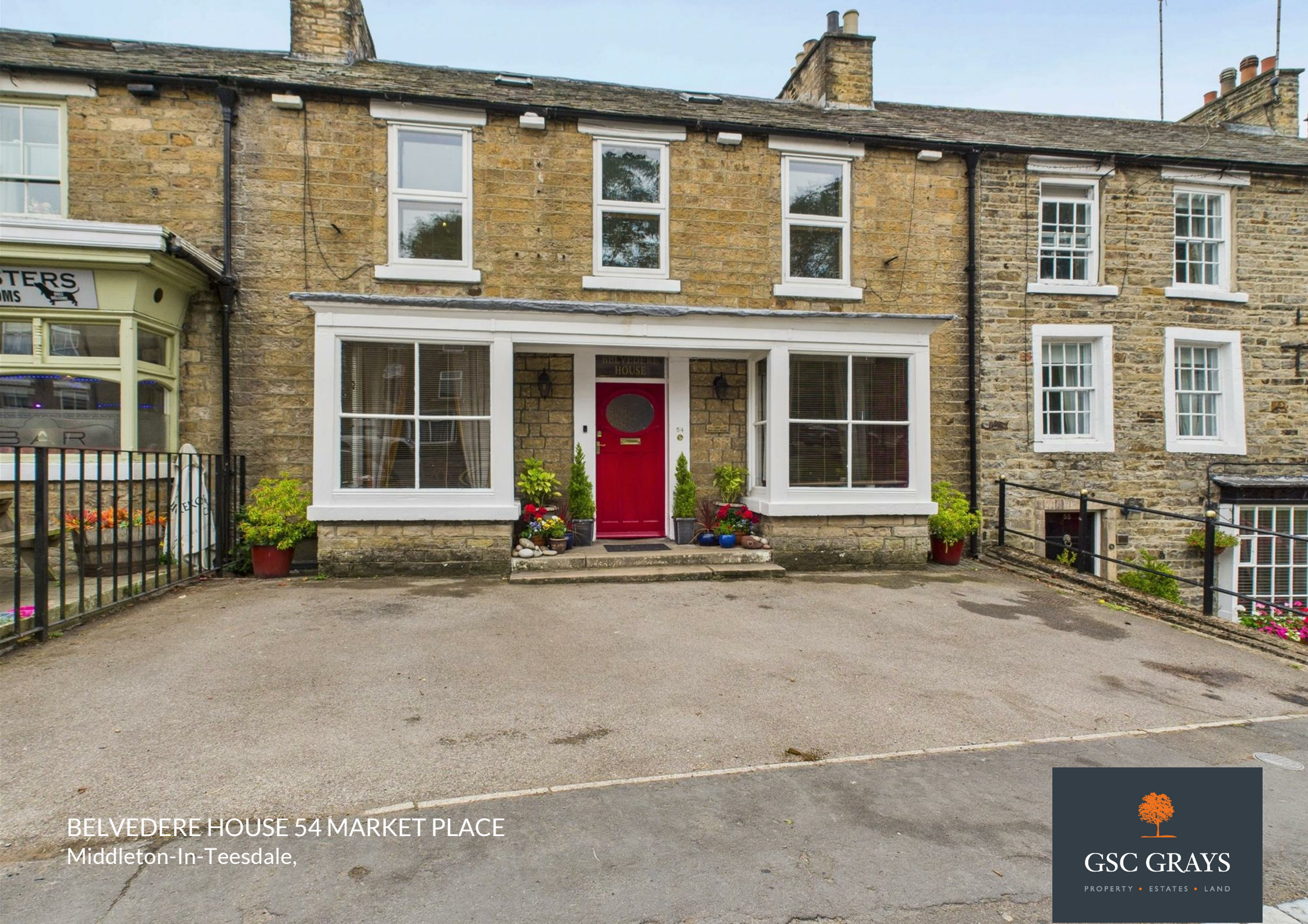
BELVEDERE HOUSE 54 MARKET PLACE Middleton-In-Teesdale,