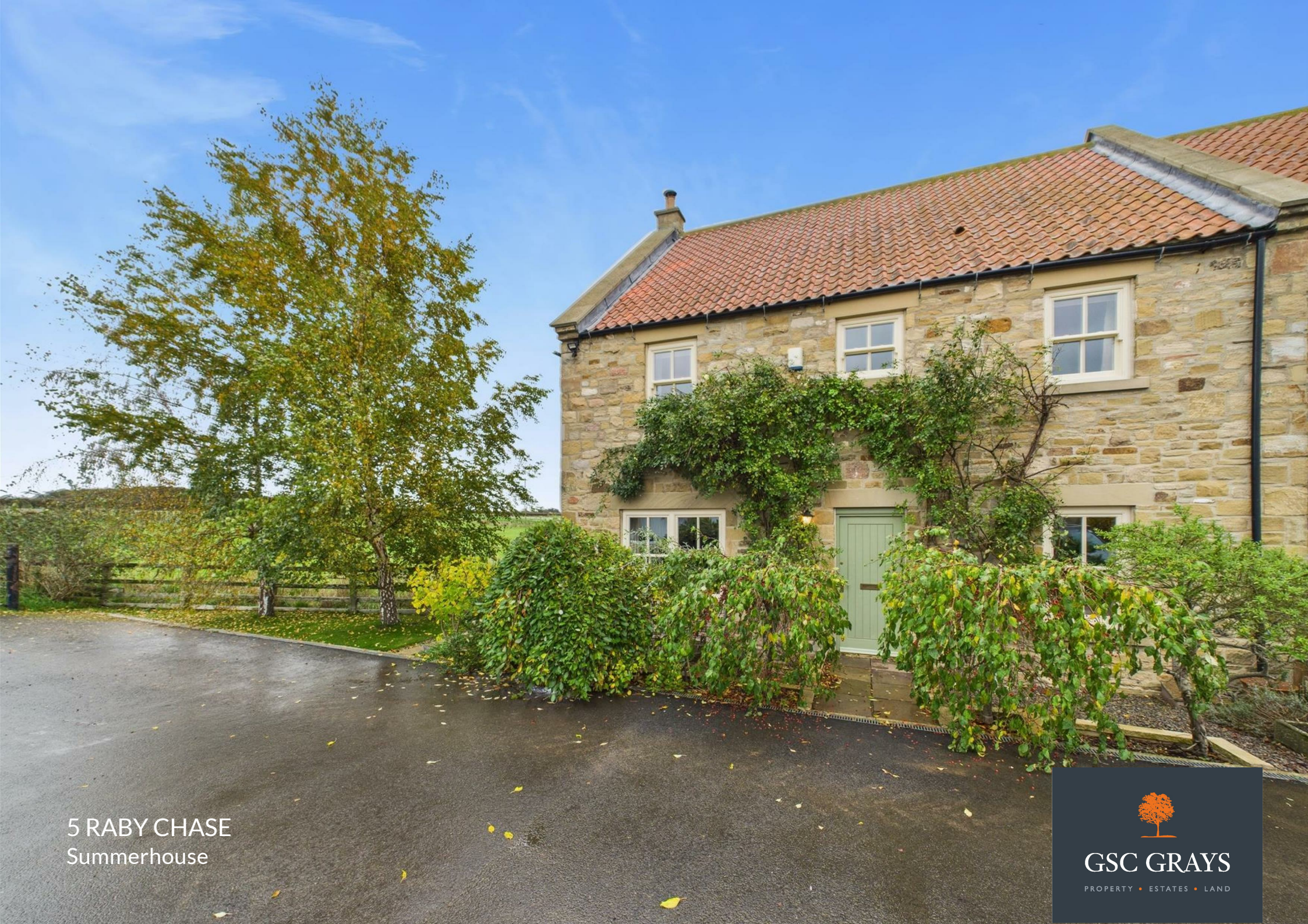
5 RABY CHASE Summerhouse