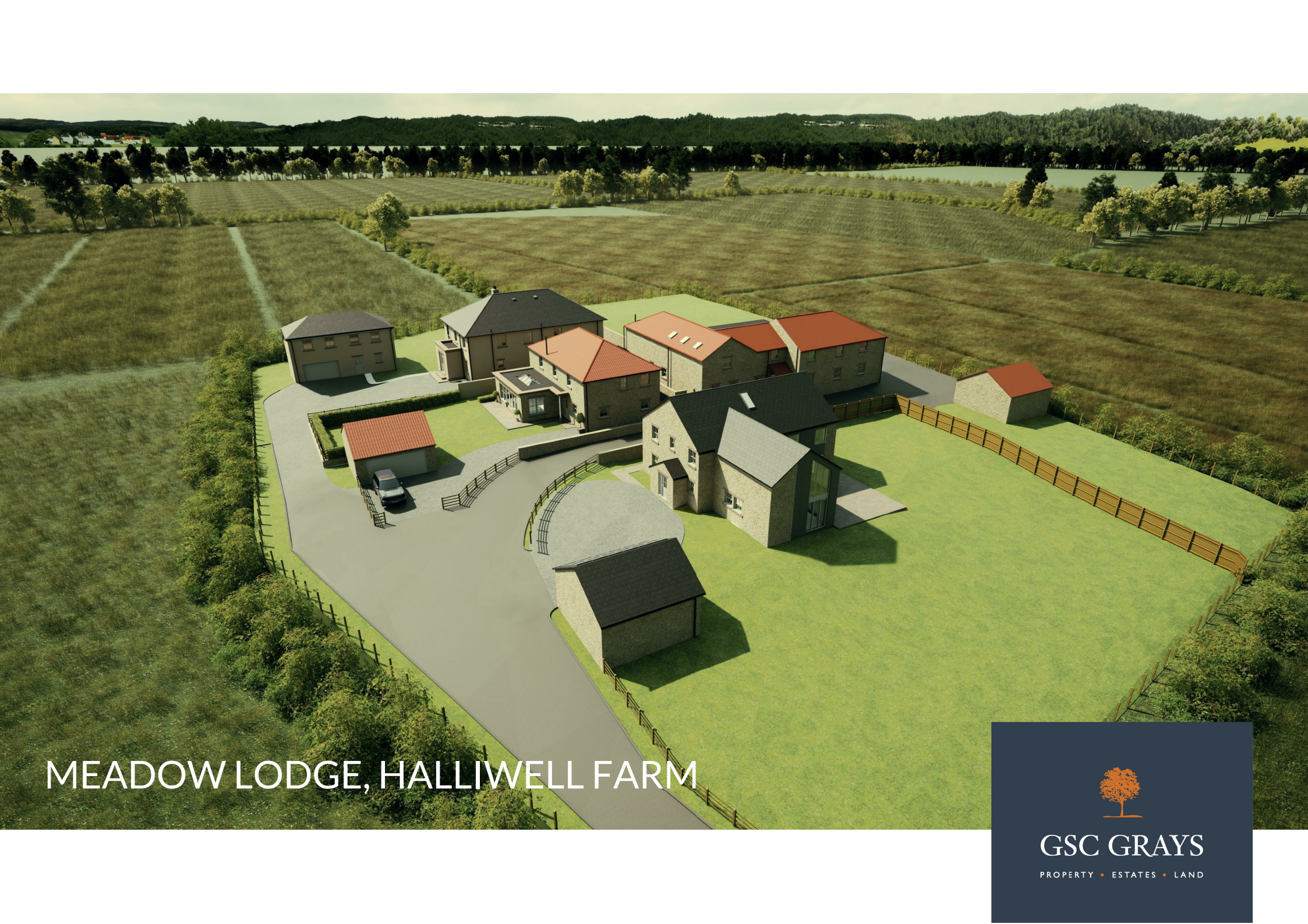
MEADOW LODGE, HALLIWELL FARM