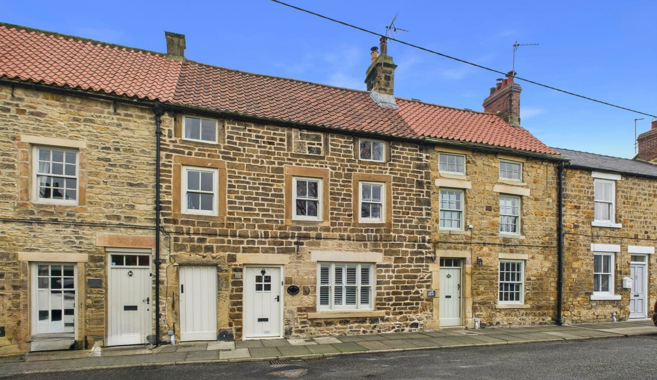
THE OLD POOR HOUSE 51 NORTH GREEN Staindrop, Darlington