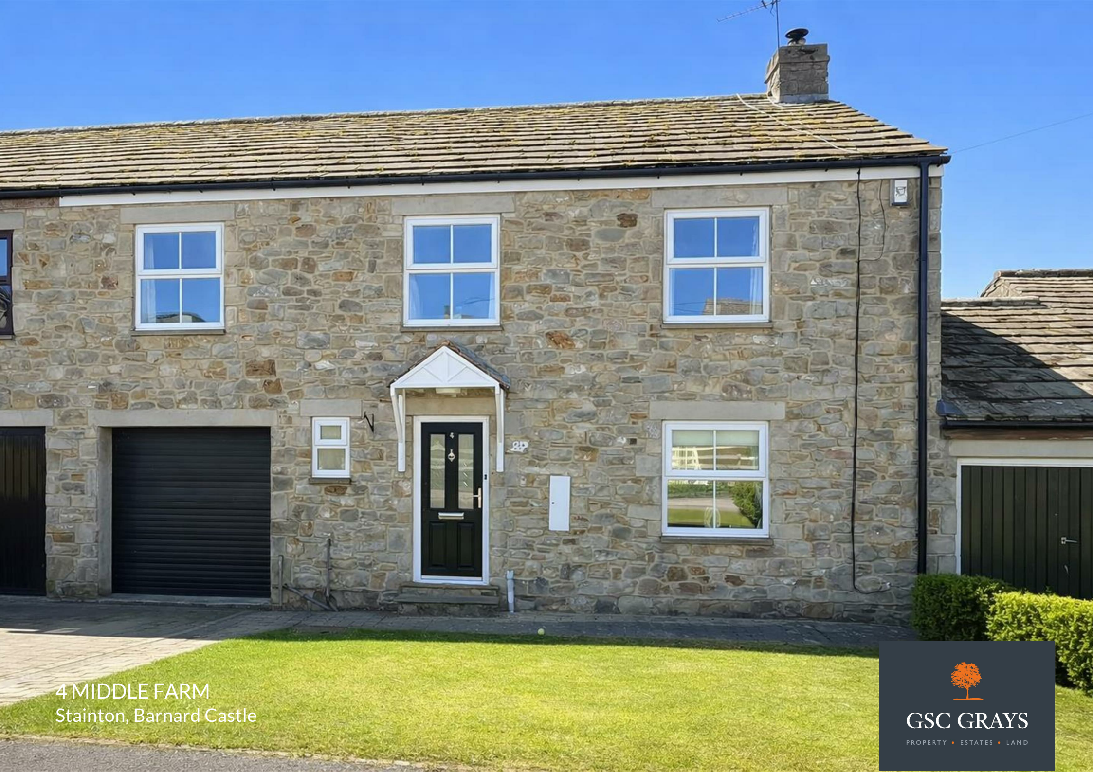
4 MIDDLE FARM Stainton, Barnard Castle