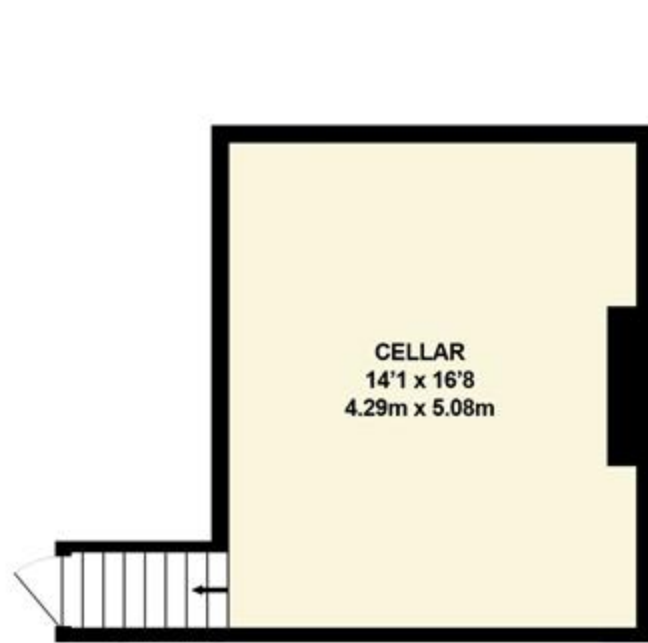
BASEMENT 234 SQ.FT. (21.8 SQ.M.) APPROX.