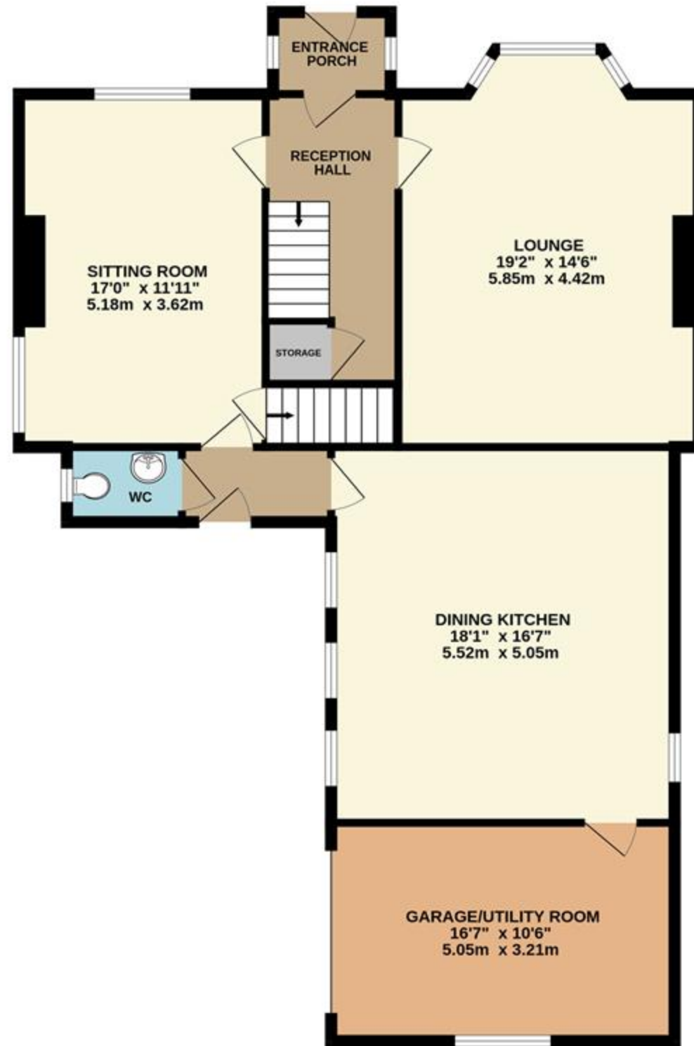
GROUND FLOOR 1103 SQ.FT. (102.5 SQ.M.) APPROX.