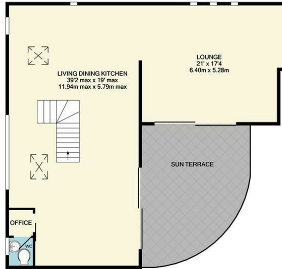
FIRST FLOOR APPROX. FLOOR AREA 1073 SQ.FT. (99.7 SQ.M.)