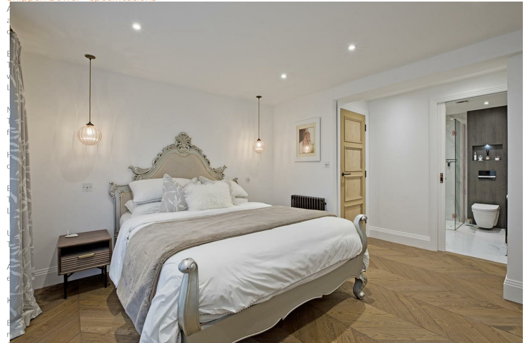
Quooker Cube tap providing boiling, chilled, and sparkling water.