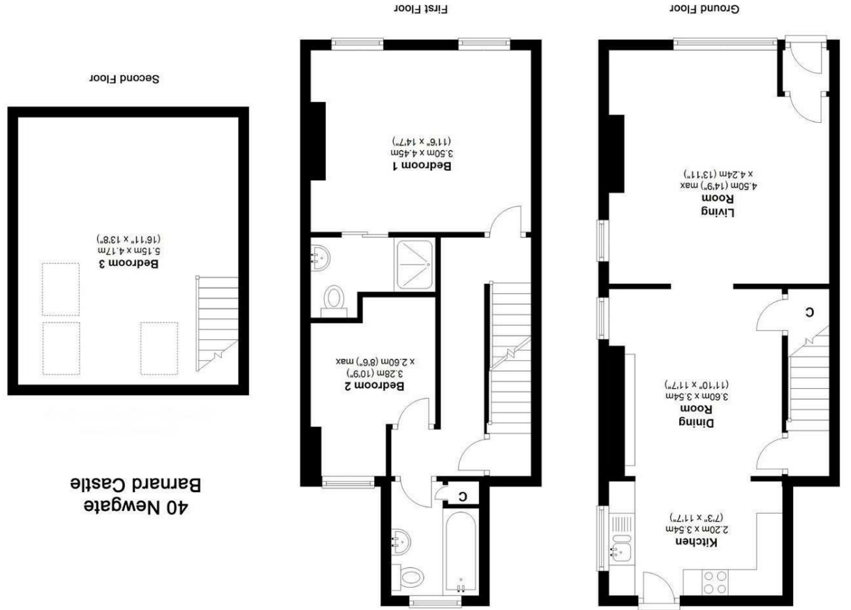
40 Newgate Barnard Castle

Whilst every attempt has been made to ensure the accuracy of the floorplans contained here, measurements of doors, windows, rooms and any other items are approximate and no responsibility is taken for any error, omission or mis-statement. This plan is not drawn to scale and is for illustrative purposes only & should be used as such by any prospective purchaser. Created especially for GSC Grays by Vuesky Ltd