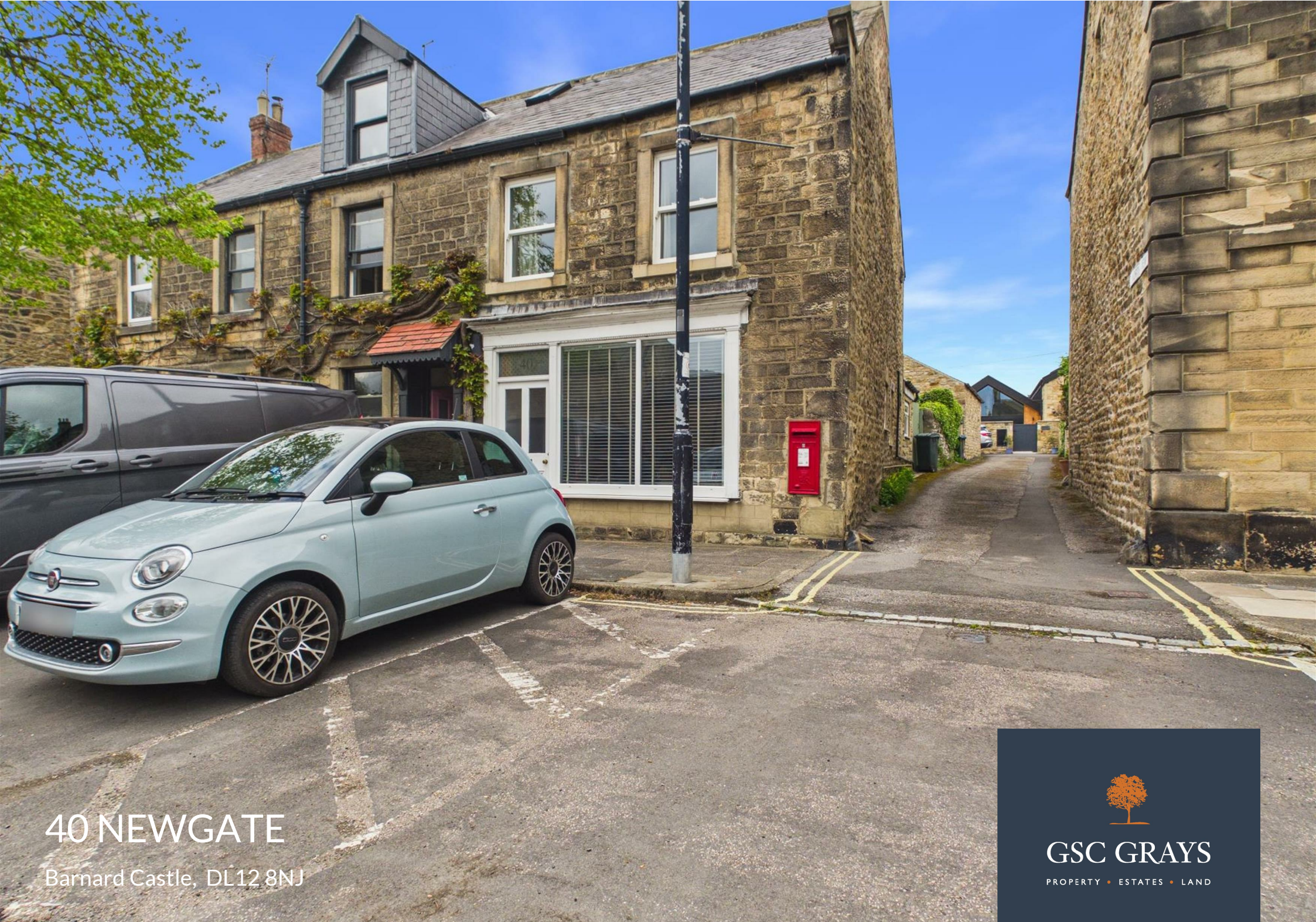
40 NEWGATE Barnard Castle, DL12 8NJ